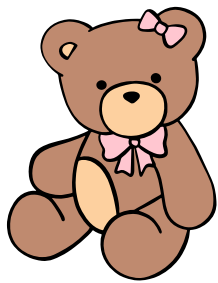
Teddy Bear •

Directions: Look at each non-living thing on the left. Draw a line to match it to where it is usually found on the right.