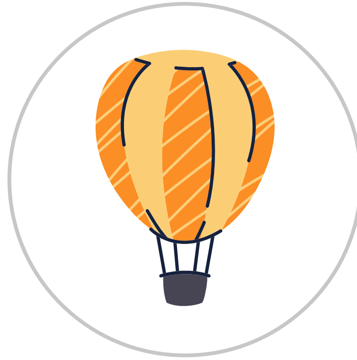
hot air balloon